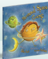
Personal Space Camp