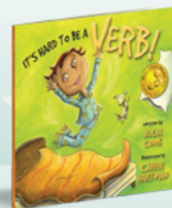
It's Hard To Be A Verb